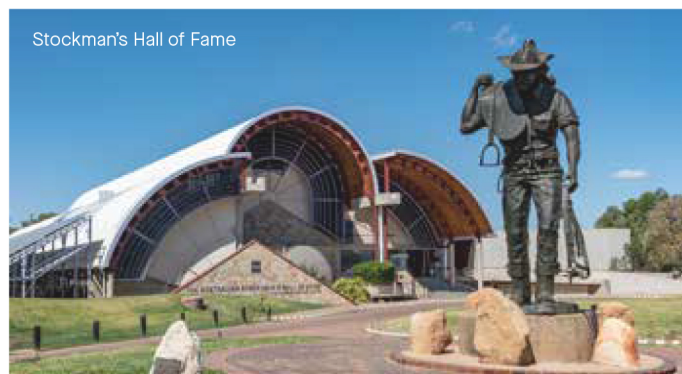
Stockman's Hall of Fame

Brisbane Departure This journey is also available from Brisbane. See pages 26-27, or search AACQB9 on aptouring.co.nz