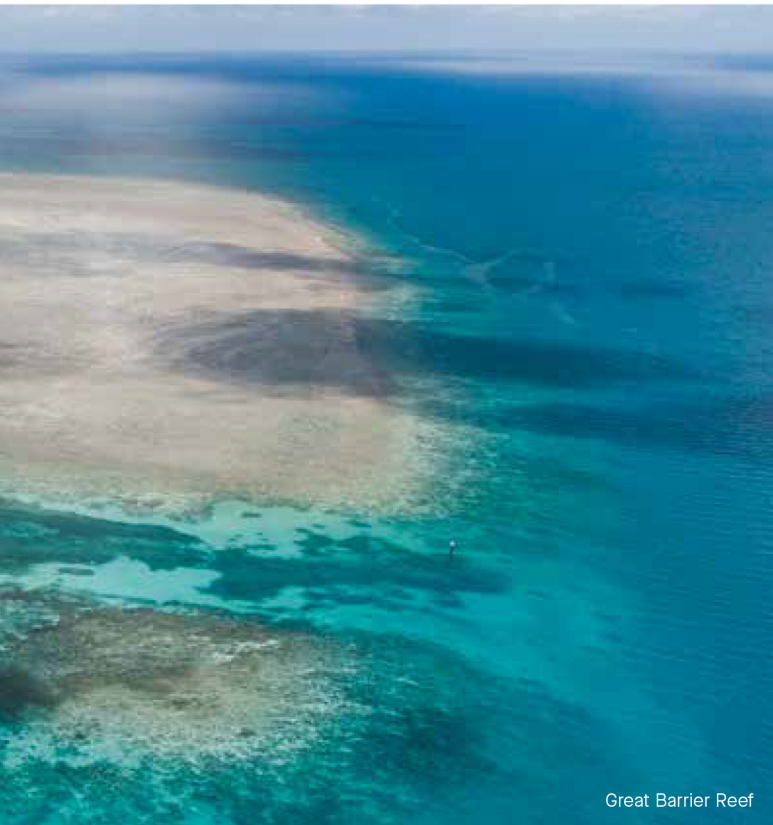
Great Barrier Reef